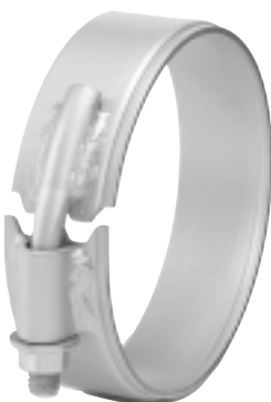
Offset MaxGrip™ Bent Bolt Clamps Models for Tube to Flex Connections