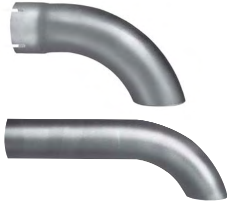
Tailpipes O.D. & I.D. Styles