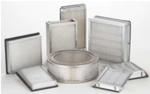
Donaldson General Aviation Engine Air Intake Filters

If you own or operate a Beechcraft, Piper, Cessna or Mooney airplane, or a Bell, Aerospatiale (Eurocopter) or MD Hughes rotorcraft, chances are it was delivered with Donaldson filters onboard. Airframe and engine manufacturers trust Donaldson quality. We've been providing superior pleated media engine air intake, fuel, lube and hydraulic filters for piston-powered aircraft for over 40 years. When it comes time for your next maintenance check, don't compromise the integrity of your airplane! Ask your mechanic to install Donaldson OEM filters for maximum performance and filter life.