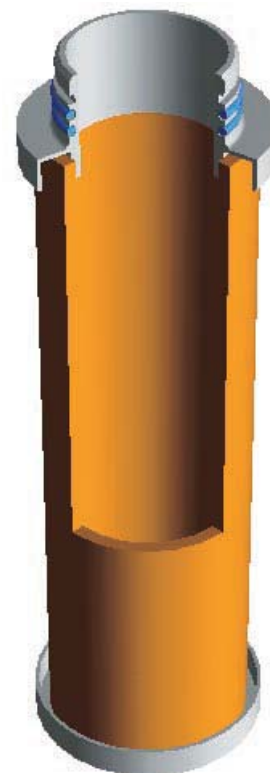
Cross section of the Ultraporex® prefilter

By utilising various filtration mechanisms such as retention by direct impact, sieve effect and diffusion effect, liquid aerosols and solid particles will be retained in the filter down to a 5 µm particle size. The high-grade sinter bronze medium guarantees not only a high load of contaminants but also the regeneration of the filter element.