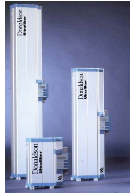
Ultracure 2000 Superplus

Compressed air is led through the inlet of the unit (J) and across the pre-filter (2). At this stage, the air is cleaned from particles and condensate. The condensate is removed via a membrane condensate drain (5). The following desiccant dryer reduces the water vapour content of the compressed air down to a pressure dew point of -40^{\circ}\text{C} (equivalent to a remaining water content of 0.11\text{ g/m}^3 ). In the following purification stages (SP, AK, OX) (9) the content of \text{CO}_2 is adsorbed to a level far below 500 ppm the content of \text{SO}_2 below 1 ppm and the content of \text{NO}_x below 2 ppm. In the AK stage oil vapours, hydrocarbons, taste and odours are adsorbed to a level far below 0.003\text{ mg/m}^3 . In the OX stage a catalyst converts \text{CO} to \text{CO}_2 and thereby reduces the carbon monoxide level down below 5 ppm. The final particle filter (3) removes all particles which might be carried over from the adsorption and /or catalytic stages.